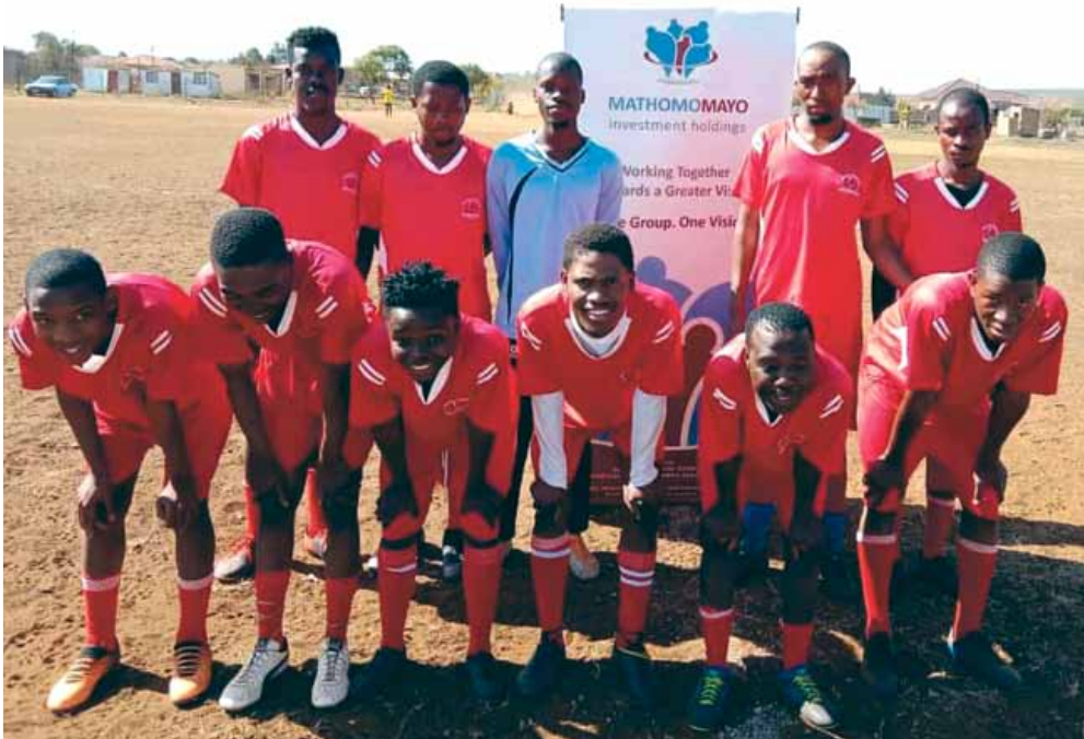
Jane Furse Blackpool FC are confident to reach the SAB SAFA Sekhukhune Regional Football League Play-offs and represent the region in the province.