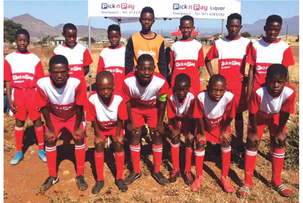
Ngwaabe Sports Designers FC is among teams showing determination to win the SAB SAFA Sekhukhune Regional Football League.