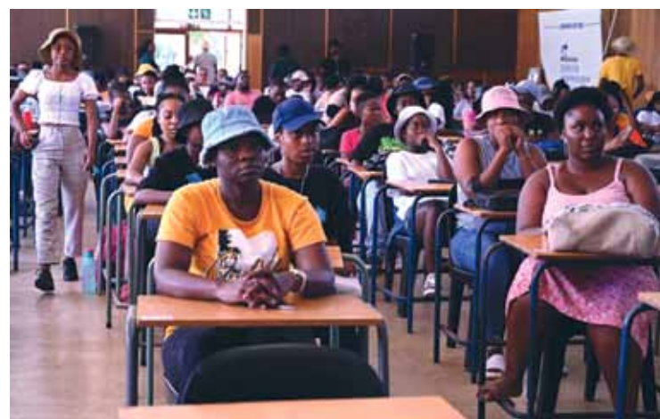
Young entrepreneurs listening attentively to NYDA presentations during the Sekhukhune District-Based Activation held at Sekhukhune TVET College CS Barlow Campus in Motetema.