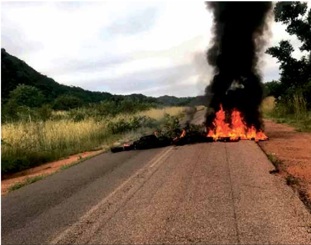
The R25 Road between Phooko and Verena was barricaded with burning tyres by angry residents who were complaining about the poor state of the road.

Angry community members from various villages in Moutse have on Sunday 19 February, gone on the rampage and barricaded the busy R25 Road with stones and burning tyres.