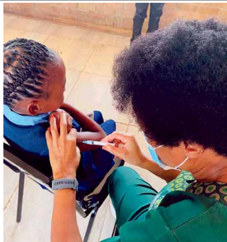
MEC for Health in Limpopo, Dr Phophi Ramathuba, vaccinating one of the Thabanaswana Primary learners during the HPV Vaccination Campaign in Ga-Masemola Village.

cancer, which can include the base of the tongue and tonsils. CDC indicates that cancer often takes years, even decades, to develop after a person gets HPV, while genital warts and cancers result from different types of HPV. "The drive of this intervention is to implement the one of the four basic component of cervical cancer control, namely primary prevention. Our teams will visit public and special education schools during February to administer free HPV vaccination to girls in grade 4 and who have already turned 9 and older," she said. Ramathuba has made a clarion call to parents to sign the consent forms which they receive from the school that the child attends. According to the South African Department of Health, about 4 250 South African women die of cervical cancer and 3 800 of breast cancer every year, which are unfortunate deaths that can be prevented through early vaccination.